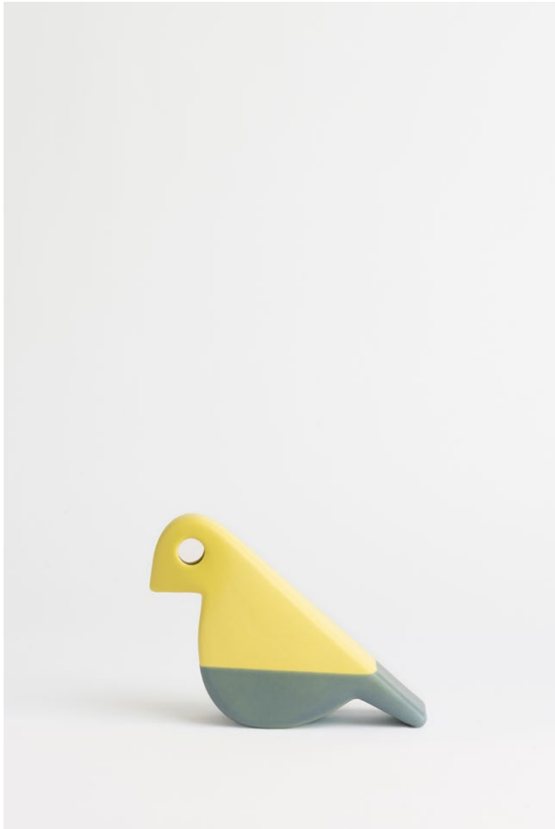
REF. IKN 20 BIRD FIGURE

cm 15 H x 20 L x 6 P Yellow matt / Gray matt