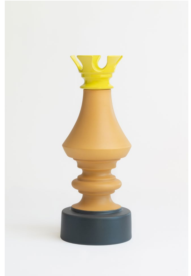
REF. IKN 6 CHESS / TOWER

Potiche Vase cm 33 H x 13,5 Ø Ocher matt / Gray matt