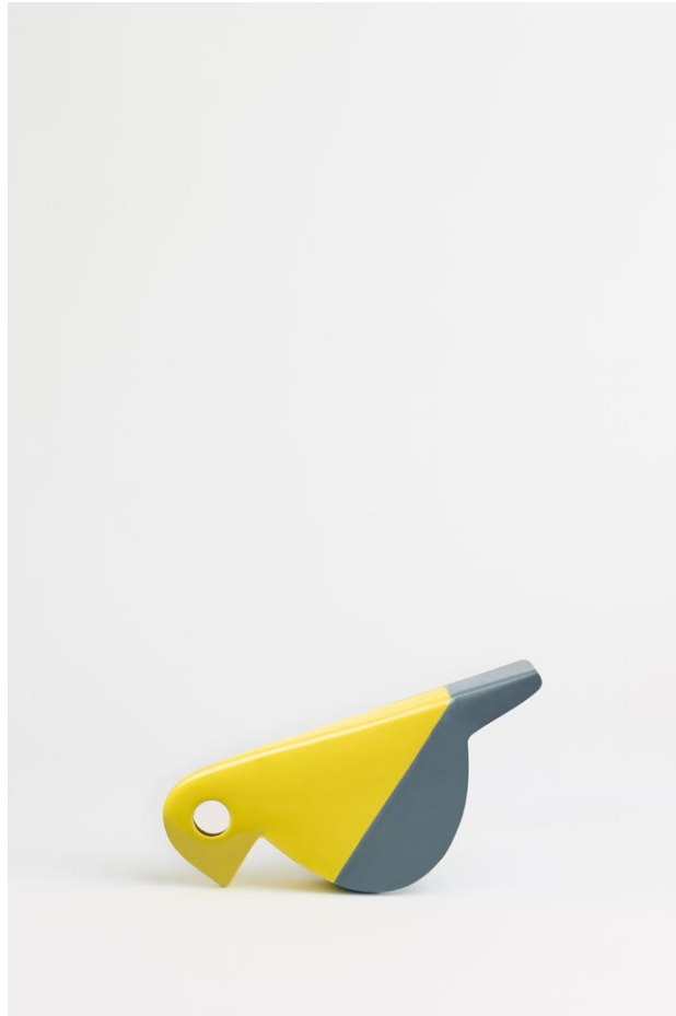
REF. IKN 21 BIRD FIGURE

cm 15 H x 20 L x 6 P Yellow matt / Gray matt