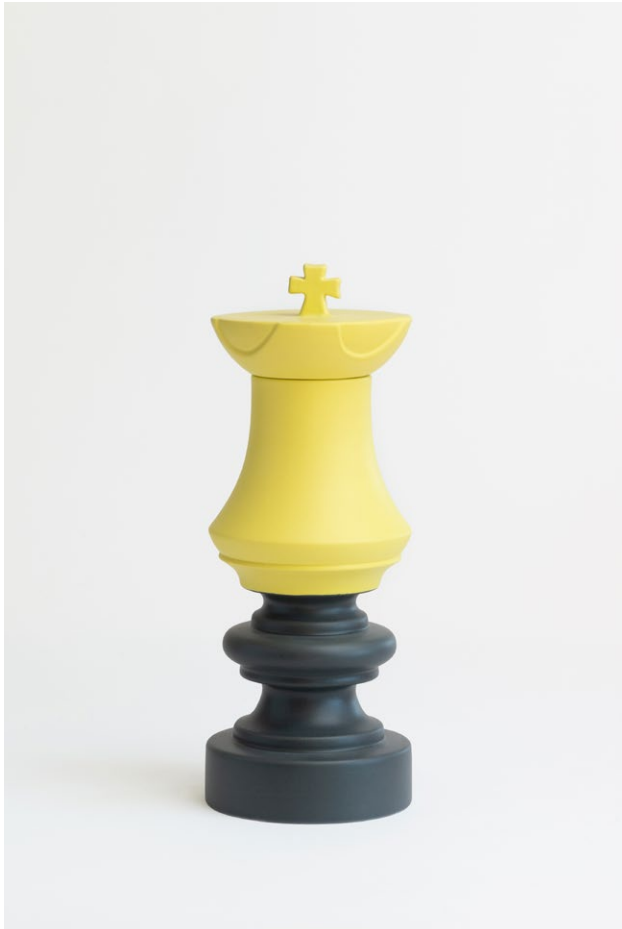
REF. IKN 4 CHESS / KING

Potiche Vase cm 36 H x 13,5 Ø Yellow matt / Gray matt