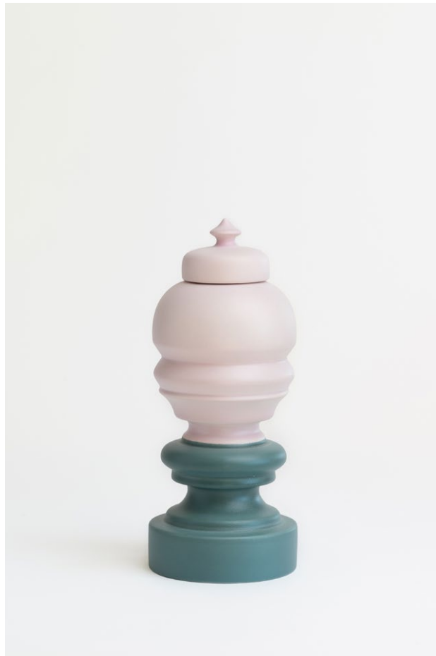
REF. IKN 2 CHESS / QUEEN

Potiche Vase cm 36 H x 13,5 Ø Pale green matt / Dark green matt