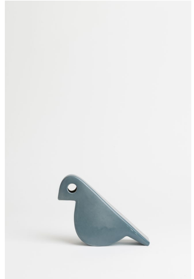
REF. IKN 25 BIRD FIGURE

cm 15 H x 20 L x 6 P Yellow glossy / Gray glossy