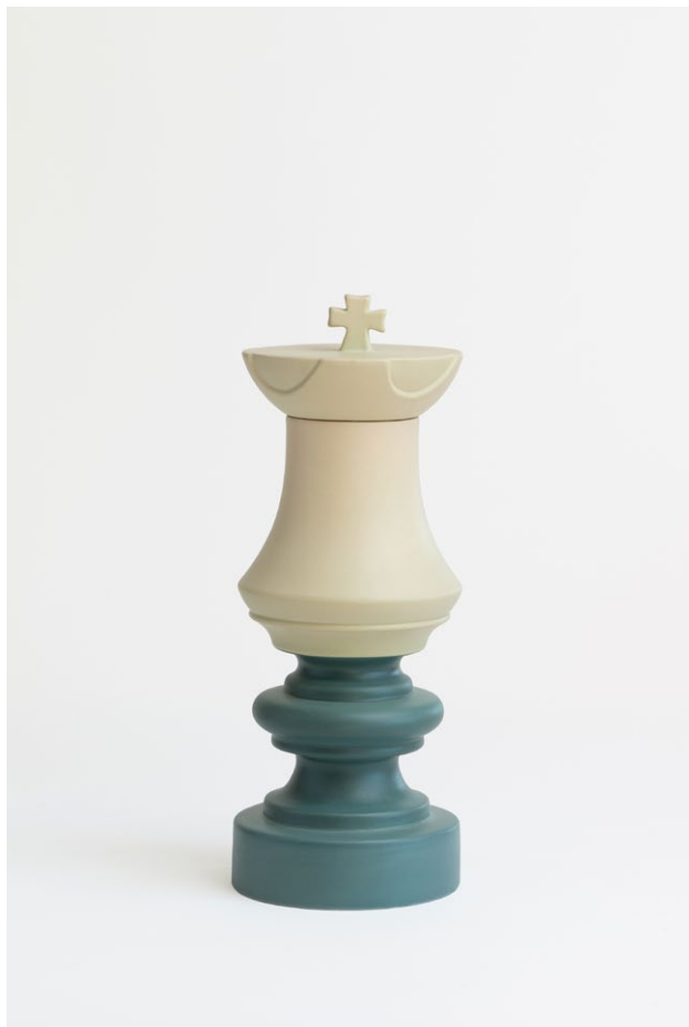
REF. IKN 1 CHESS / KING

Potiche Vase cm 36 H x 13,5 Ø Pale green matt / Dark green matt