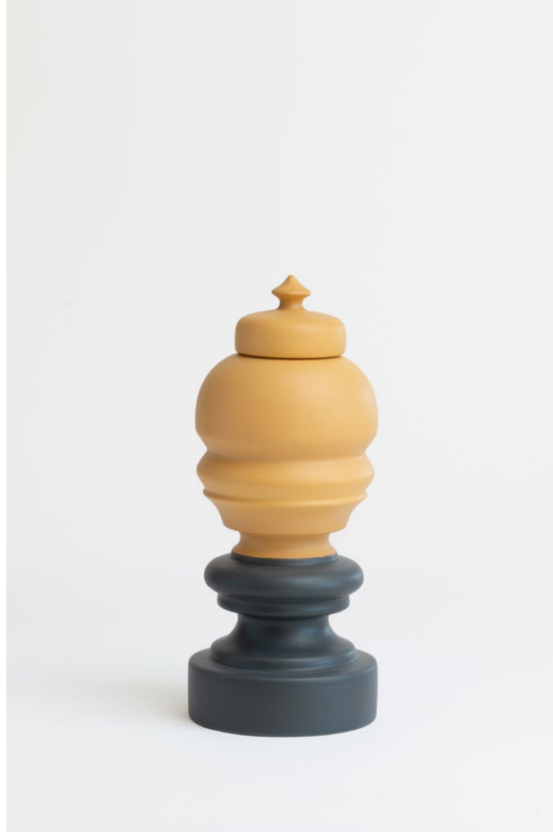
REF. IKN 5 CHESS / QUEEN

Potiche Vase cm 36 H x 13,5 Ø Yellow matt / Gray matt