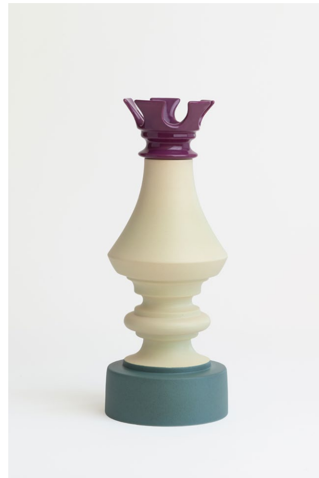
REF. IKN 3 CHESS / TOWER

Potiche Vase cm 33 H x 13,5 Ø Pink matt / Dark green matt